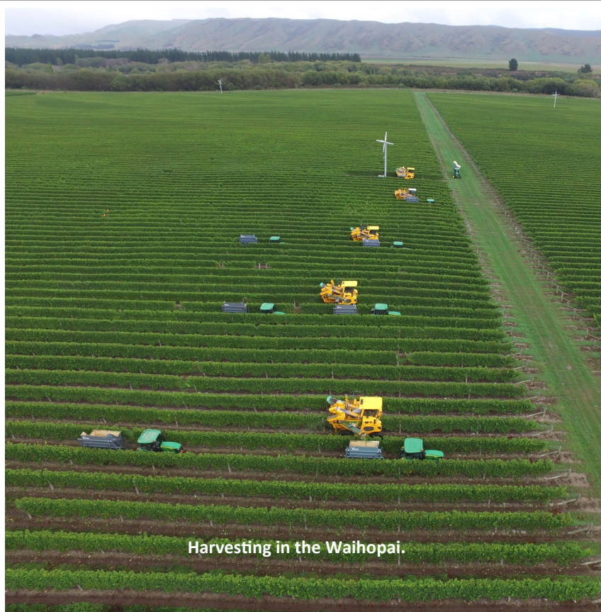
Harvesting in the Waihopai.

This year we launched a new harvesting and dispatch management software called Nupoint. We now have ipad consoles that are mounted in the harvesters. These provide the driver with a wealth of information – the location of the vineyard and the vineyard boundaries, hazard or no go areas as well